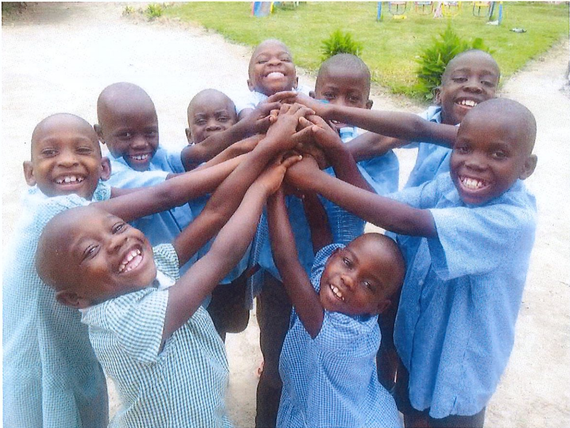
(Front cover – Image of some of the RHC children 'Together we are one')