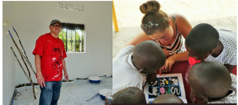
ABOVE: The children reading 'Funny bones' one of the donated books from Hungerford Primary Academy. LEFT: The volunteers ready to start Alice's bedroom.